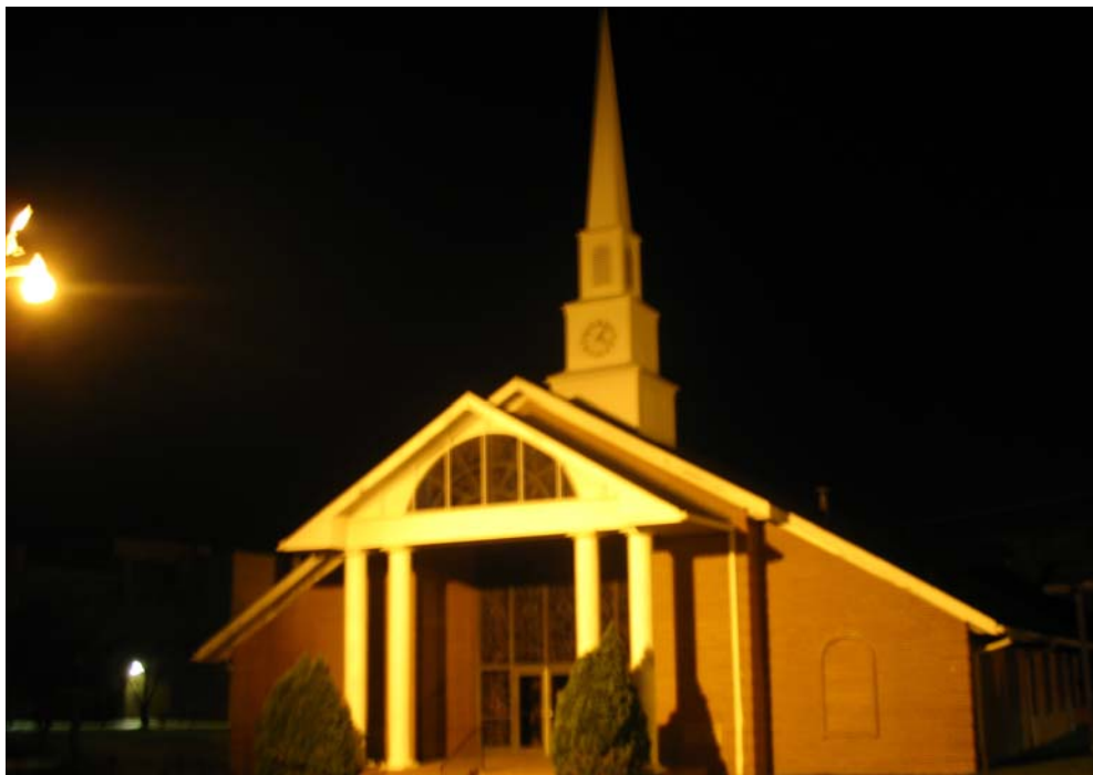
KITTIE SANSON CHAPEL (Erected in 1988)